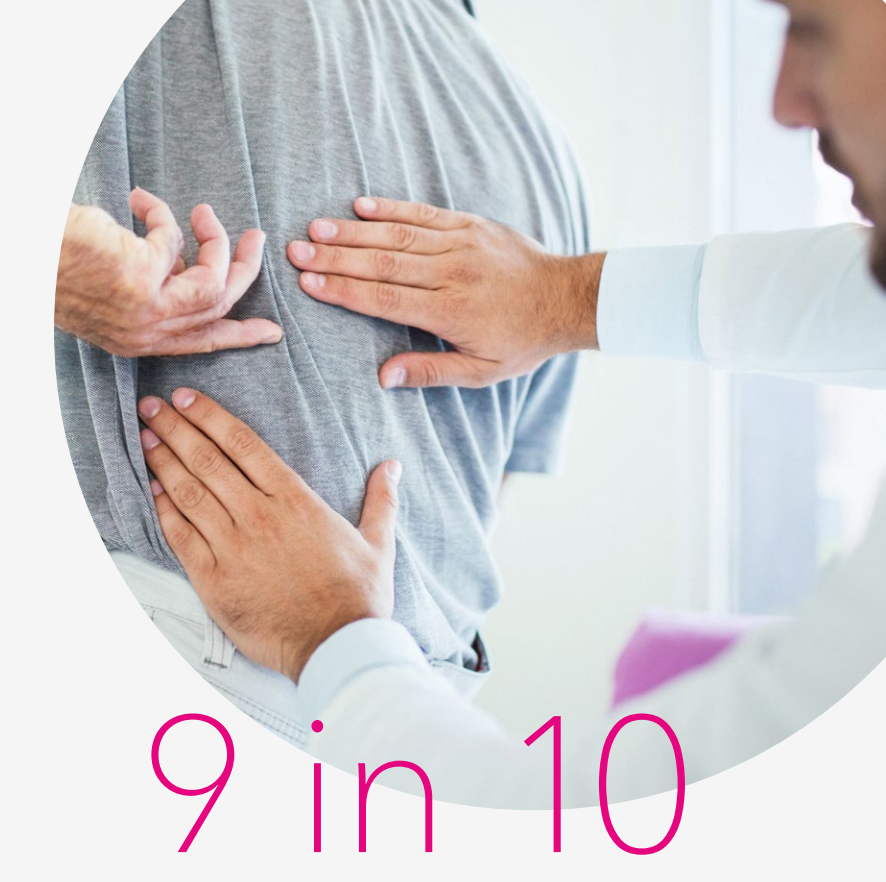
wish there were more treatment options available

Two years later, the pandemic continues to weigh on chronic pain patients by making access to care more difficult. A variety of treatment options exist which may help to alleviate pain, but care delays and an awareness gap suggest there is continued pent-up demand to be addressed, especially once the pandemic begins to retreat.